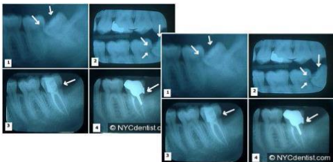
Instant backup and recovery of digital assets