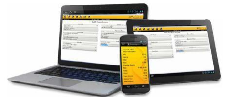
Accessibility from any device, anywhere