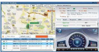
Improved Route Efficiency and Tracking